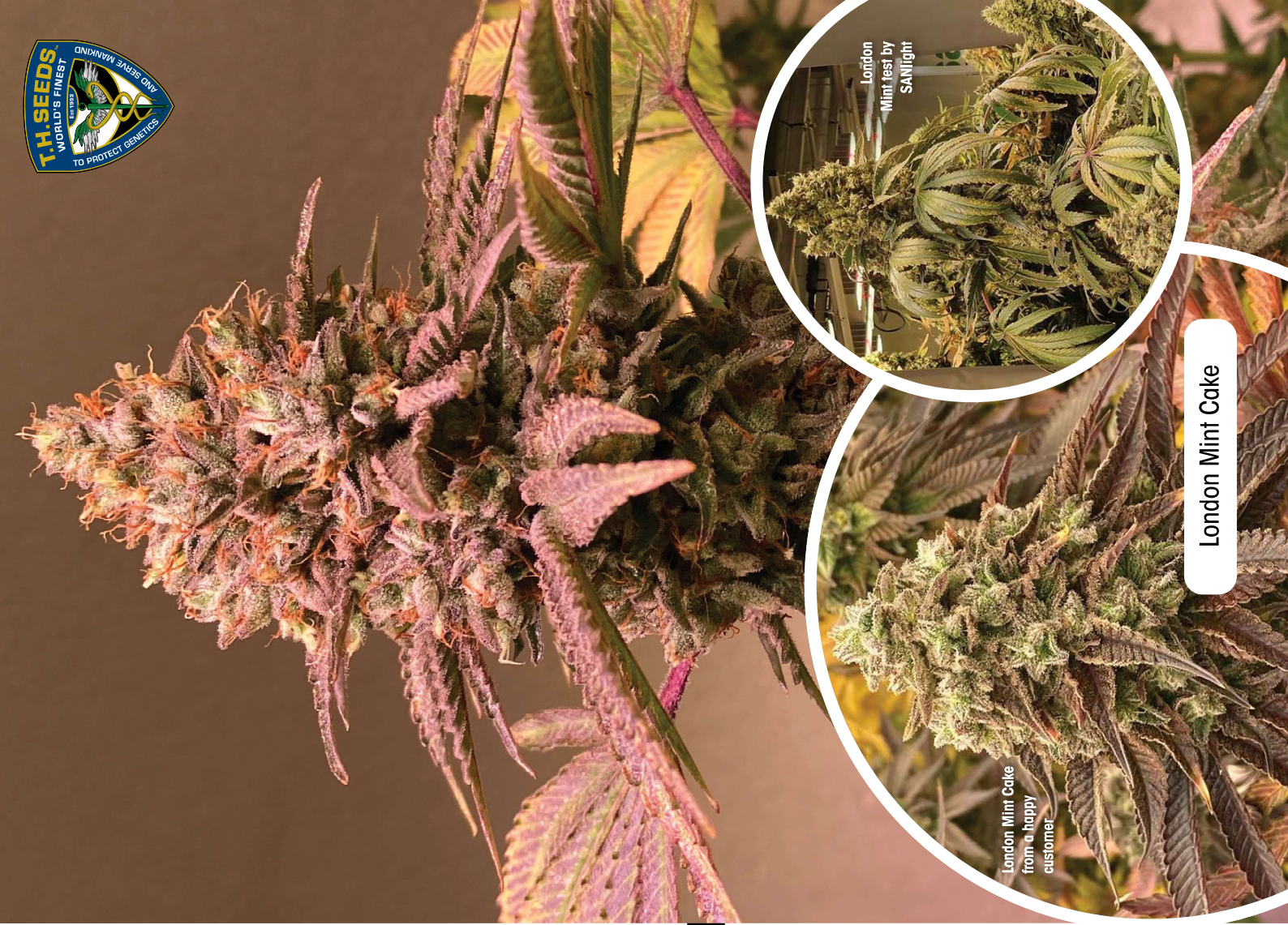
London Mint Cake

London Mint Cake is a pleasure to look at, very colorful with dense, Big Ben sized buds covered in bell-shaped trichome heads.